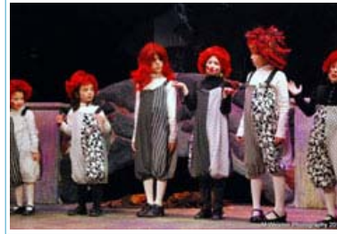
Young actors as Oompa Loompas in Penobscot Theatre Company's production of Charlie and the Chocolate Factory.