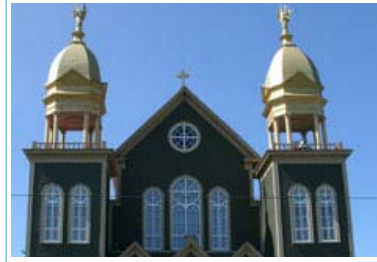
The exterior of the Musée culturel du Mont-Carmel in Lille.

The Historic Restoration Specialist is responsible for general carpentry using original materials and carpentry methods as well as general maintenance of the building and removal of non-original finishes.