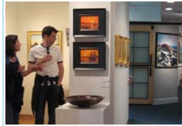
Second Friday ArtWalk at the Bayview Gallery in Brunswick.

The Executive Director is the person primarily responsible for the organization: its programming planning & execution; publicity, marketing and communications; membership, fundraising and financial management. MAR grant funding supported the retention of annual programs of Five Rivers, their planning, execution and promotion: