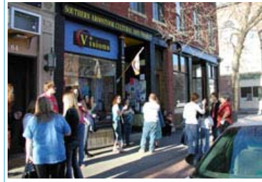
Southern Aroostook Cultural Arts Project

The Executive Director is responsible for the sustainability of the agency, basic agency management and administration, and program development. The Director builds and develops collaborative relationships with community groups, individuals, and artists to expand and strengthen agency services, implements agency procedures, and updates agency documents.