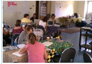
A recent training session for teachers on integrating the arts with other content areas through the use of technology.

The executive director oversees and coordinates all work done by the organization, keeping the organization running and handling key responsibilities which address MAAE's mission to strengthen education in all of the arts for all Maine students.