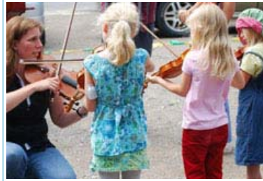
Eastport Strings Youth String Ensemble, one of the seven constituent programs at the Eastport Arts Center.

The Facility Manager is responsible for maintaining the building through her own skill, scheduling repairs through subcontractors, supervising contractors, cleaning the facility and managing other portions of our property, lawn and parking lot.