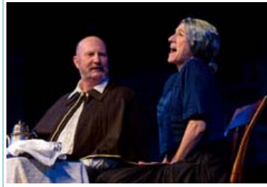
A Lincoln County Community Theatre production.

The Lincoln County Community Theater Administrator does everything and/or anything to assist the volunteers and Board of Trustees of this organization and to support the Board to fulfill its governance function.